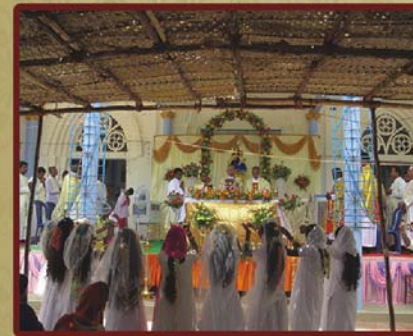
GOLDEN JUBILEE MASS, MAMALUR