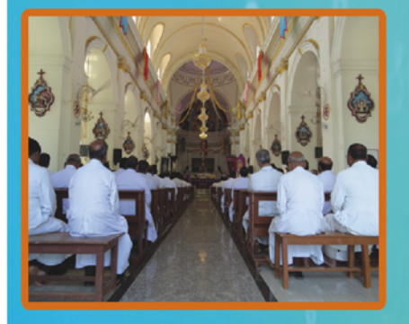
CHRISTMAS CELEBRATION, PETIT HSS