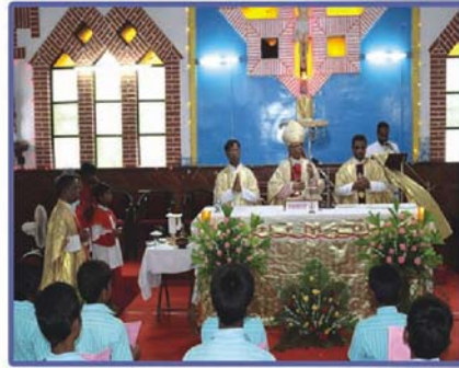
FEAST MASS, ST. ANN'S BOARDING TINDIVANAM