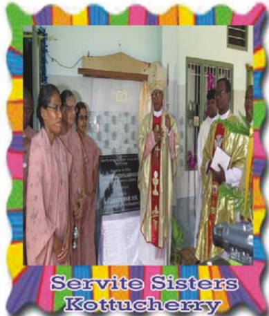
Servite Sisters Kottucherry