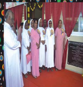
FSA SISTERS ULAGANGATHAN