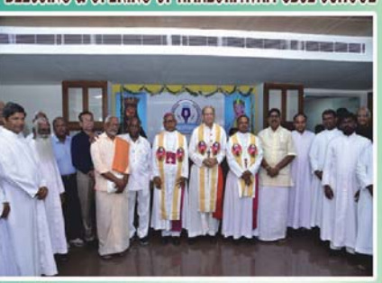
RETREAT FOR FIRST BATCH JANUARY 6 TO 10, 2020