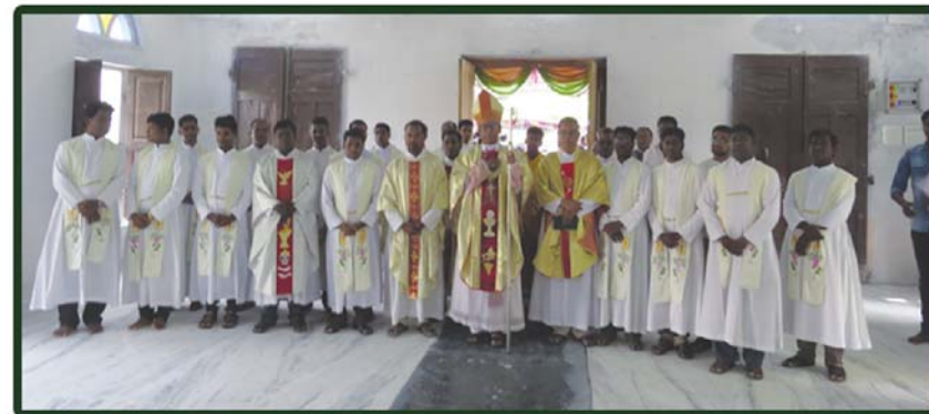
Blessing of the Renovated Church , Tirukovilur

PROCURATOR'S DESK TRIBUNAL COMMISSIONS AND REPORTS