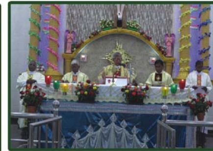
Erection of New Parish Seppakkam