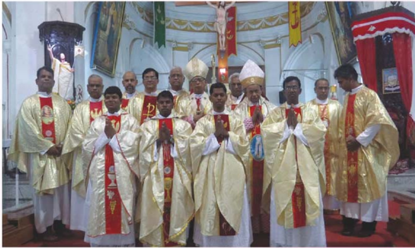
Priestly Ordination 2017