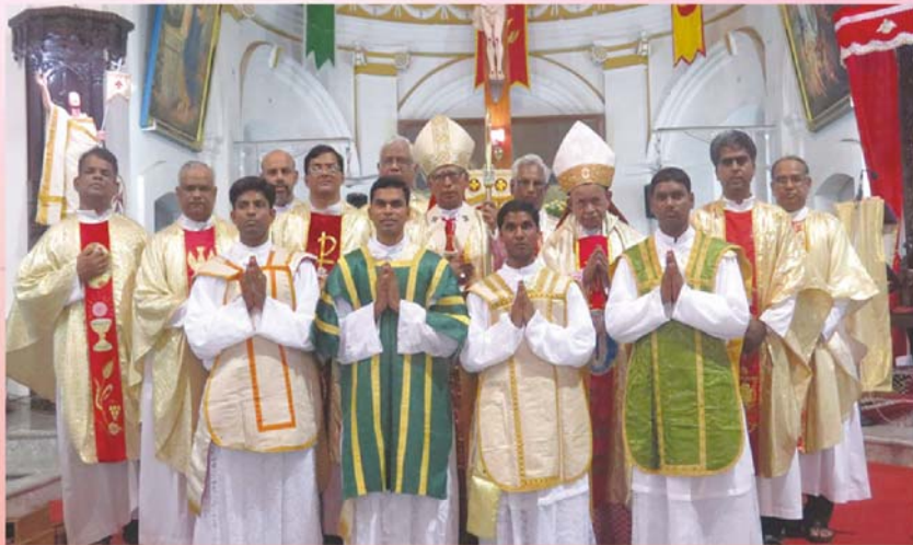
Diaconate Ordination 2017