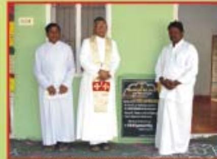
Blessing of the Baschi Block, Konankuppam