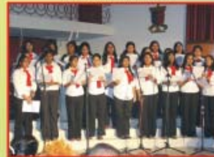
X-mas Celebrations, PIMS