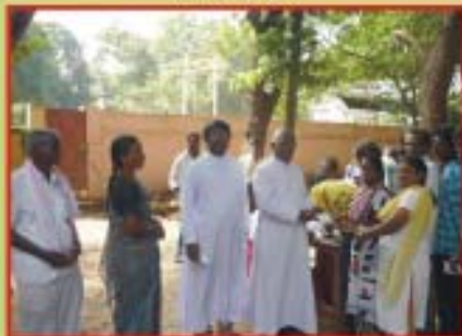
Distribution of Diocesan Scholarship, Vilupparam