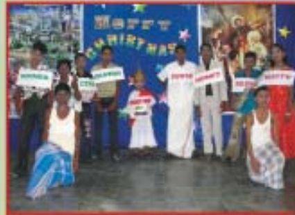
X-mas Celebration, St. Ann's High School, Pandy