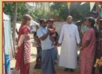
Visit, Sri Lanka Tamil Camp, Keezhothupattu