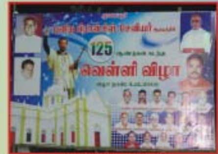
Jubilee Celebration, Murgayur