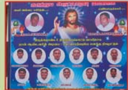
Ordination, Somapillai Nagar