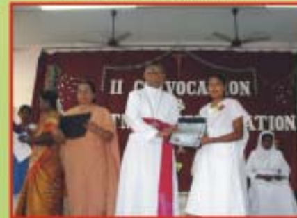
Convocation, Clary Community College, Tindivanam