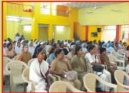
Mass - CRI, Pandy