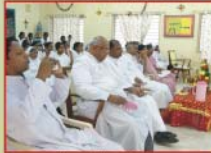
Lamen Institute, Tiruvananthapuram