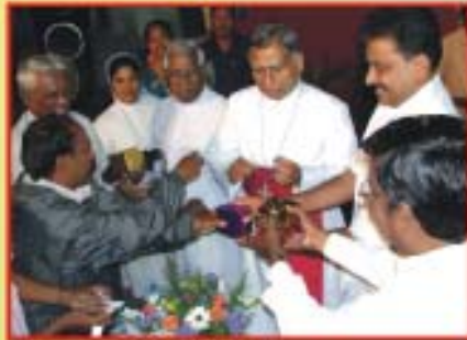
X-mas Celebration, Petit Seminaire