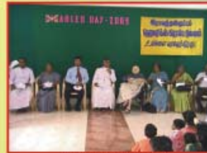
Disabled Day, Raxthanakkuppam