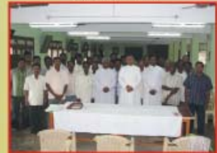
Catechists' Meeting, Uppalem