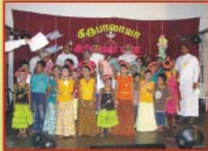
X-mas Celebrations, Street children, Pandy