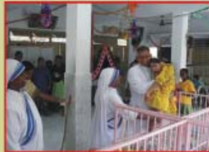
Visit to Sisha Bhavan, Pandy