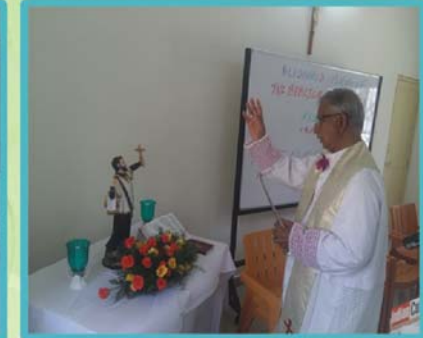
BLESSING OF BIBLICAL TAMIL CULTURAL CENTRE, UPPALAM.