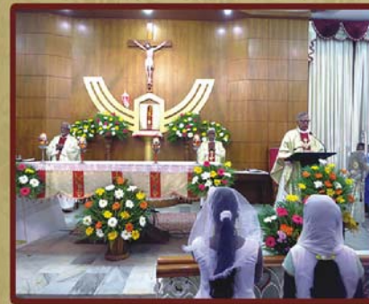
FEAST MASS, VINOBA NAGAR