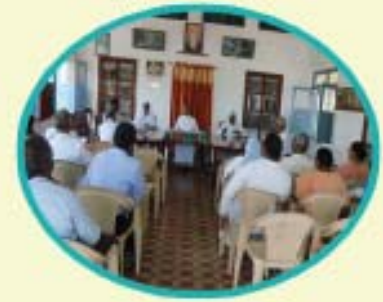
JUBILARIANS WITH OUR ARCHBISHOP