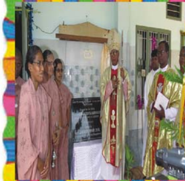
Servite Sisters Kottucherry