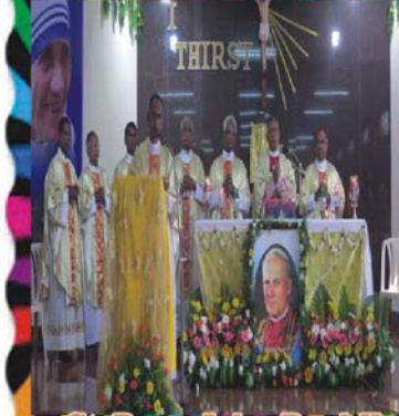
St. Pope John Paul II B.Ed College