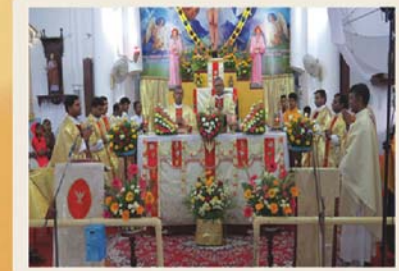
FEAST MASS KURUSUKUPPAM