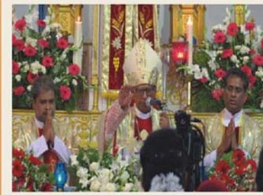
FEAST MASS MUTHIALPET

PROCURATOR'S DESK TRIBUNAL COMMISSIONS AND REPORTS