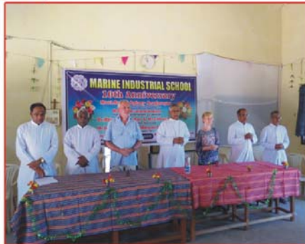
Marine Industrial School, 10th Anniversary