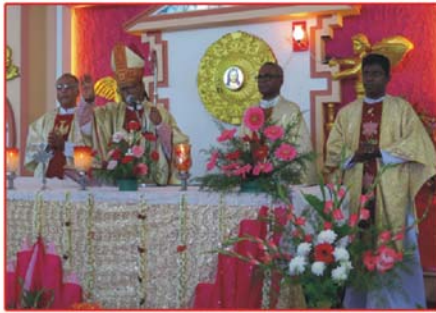
Feast Mass, Kalpet