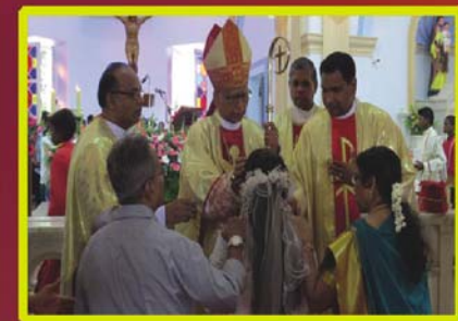
CONFIRMATION, N.D. DES ANGES