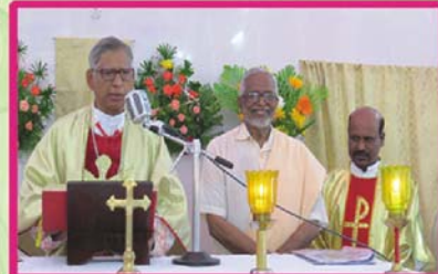
FEAST MASS, BAHOUR