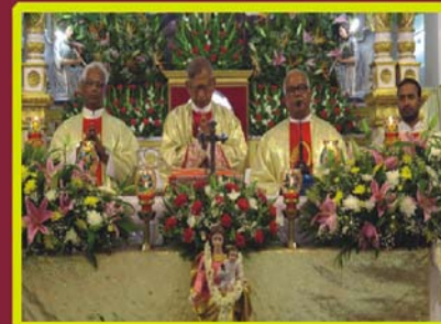
FEAST MASS, NELLITHOPE