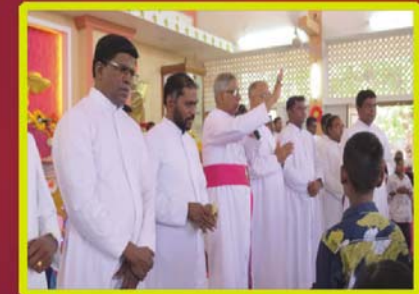
FEAST MASS, KALPET