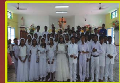
FEAST MASS, MARAKANAM