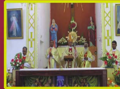
FEAST MASS, RAINBOW NAGAR