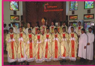
ORDINATION, SDC, CUDDALORE