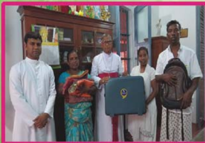
ECUCATIONAL HELP TO THE POOR CHILDREN