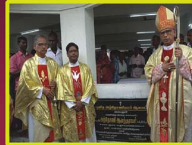
NEW CHURCH BLESSING MAIYANUR

PROCURATOR'S DESK TRIBUNAL COMMISSIONS AND REPORTS