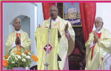
GLODEN JUBILEE MASS, CATHEDRAL