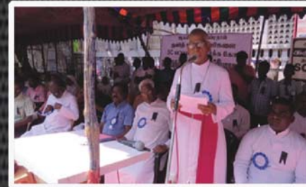
BLACK DAY PUBLIC MEETING, PONDICHERRY