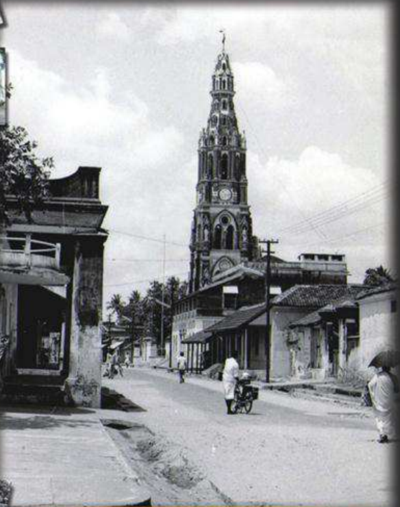
A 1980 VIEW OF THE MAGNIFICENT STEEPLE OF OUR LADY OF ANGELS CHURCH, KARAIKAL